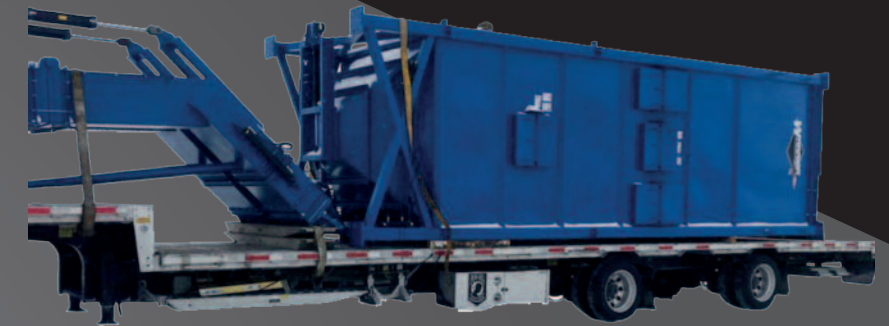
Factory assembled unit that arrives on the jobsite ready to be installed