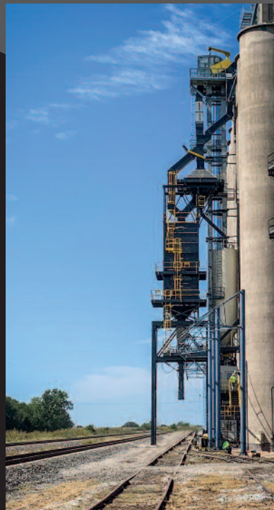
“Over the Track”