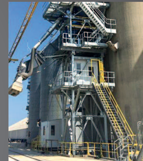
Lower support structure with access stairway, sampler, control room and loadout spout.